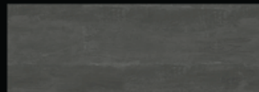
Chester Black 41 x 114 cm.