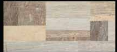
Multi Hampton 31.6 x 63.2 cm.