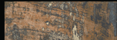
Kunny 17,5 x 50 cm.