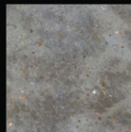
Limit 80 x 80 cm.