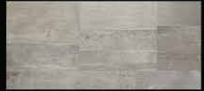
Multi Cemento 31.6 x 63.2 cm.