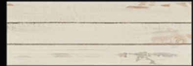
Teak Listones 17,5 x 50 cm.