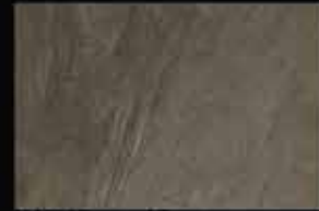
Multi Pietra Bronzo 40 x 60 cm.