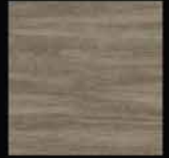
Vasari Brown 44,7 x 44,7 cm.