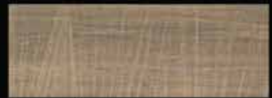
Rovere Brown 17.5 x 50 cm.