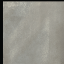
Advance Grey 80 x 80 cm.