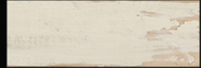
Teak 17,5 x 50 cm.