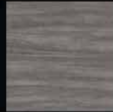
Vasari Grafito 44,7 x 44,7 cm.