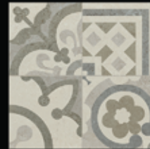
Riviera Pearl (6 different designs) 44.7 x 44.7 cm.