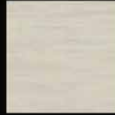
Vasari Neutro 44,7 x 44,7 cm.