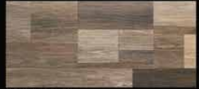
Multi Skeby 31.6 x 63.2 cm.