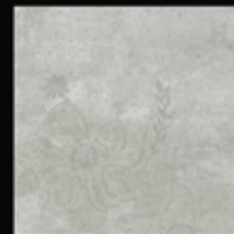
Mystery (6 different designs) 44.7 x 44.7 cm.