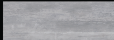
Chester Ceniza 41 x 114 cm.