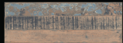
Kunny Listones 17,5 x 50 cm.