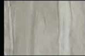
Multi Pietra Grigio 40 x 60 cm.