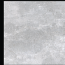
Lava 44.7 x 44.7 cm.