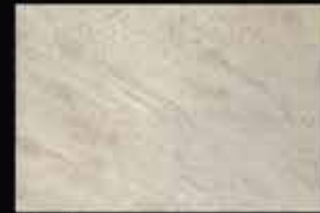
Engineer 40 x 60 cm.