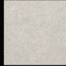
Concrete Pearl 44.7 x 44.7 cm.