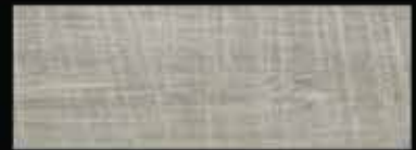
Rovere Grey 17.5 x 50 cm.